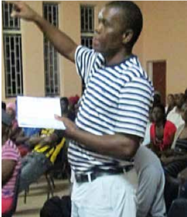
Community feedback and questions are welcomed.

Management of the Boikarabelo coal mine completed the second round of community engagement meetings during March 2014.