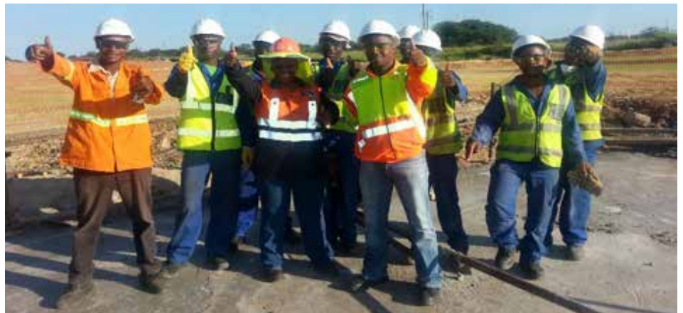
Safety celebrations with the railway bridge 9 employees.