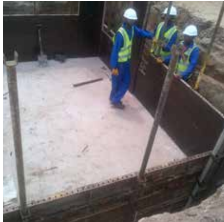
Bridge foundations being laid.