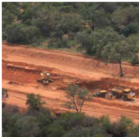
Initial development of a bridge over the rail construction.