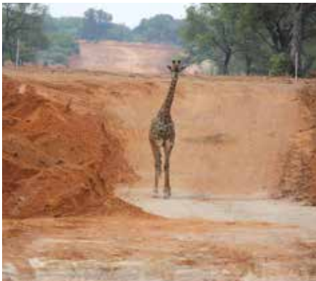
Close inspection of work.

The inquisitive animals were happy with the work and soon moved on to inspect other areas of the mine site.