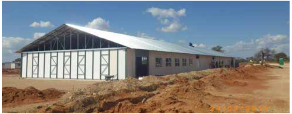
Nearing completion – the large kitchen and dining room takes shape.

Rail construction is well into its stride. Foundations for the first major bridge are now visible above ground level from the public road. Water for construction is being provided by a series of boreholes and tank installations along the route; as part of Boikarabelo's commitment to the local community these installations will be left for the benefit of the neighbouring farmers when the rail works are completed.