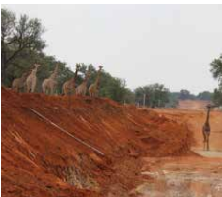
8 sets of eyes are better than 1.