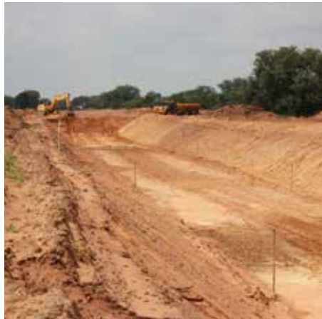
Excavation of the rail cutting.