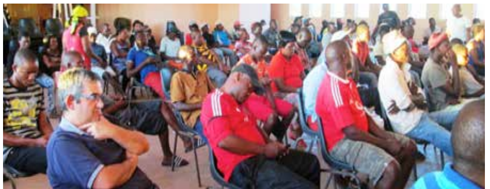
Thoughtful reflection at one of the community meetings.