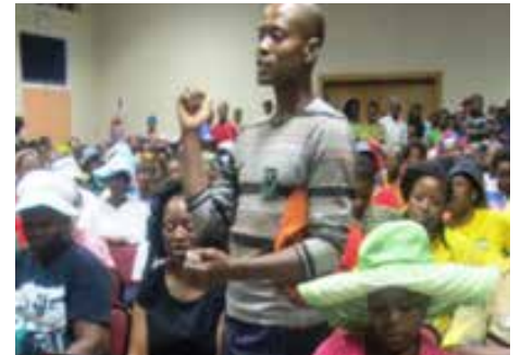
Questions are welcomed and encouraged.

The sourcing of supplies and services from local businesses is key to the Boikarabelo coal mine. As a result, the importance of seizing entrepreneurial opportunities, during the construction and operation of the mine, was again emphasised at the meetings. Members were given the new Small Medium and Micro Enterprises email address ( smmeprof@resgen.com.au ) and were reminded of the very clear requirements, in terms of documentation and criteria, which are needed for successful tendering selection.