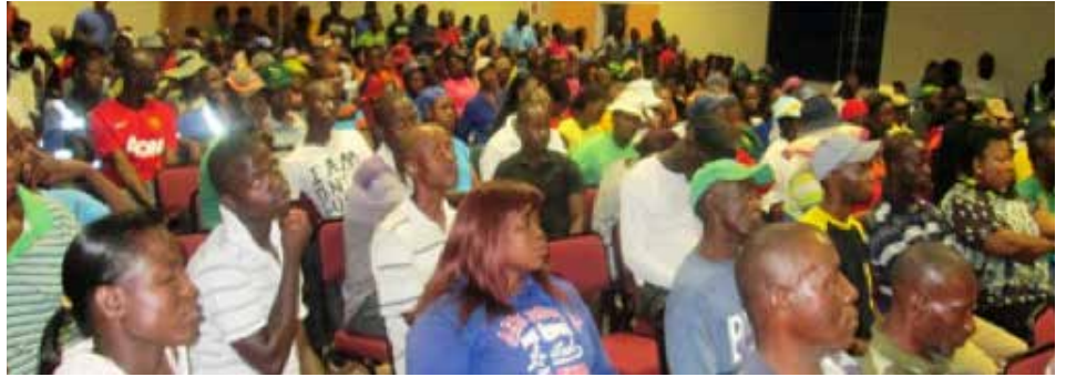
Community members listening attentively at one of the community meetings.

Critical to these community engagement meetings was the introduction of an Executive Community Engagement Forum consisting of representatives from each community as well as members of the Boikarabelo mine management. Using the existing, traditional communication structures in each community the Executive Community Engagement Forum will work together to keep each other informed of developments not just at the mine site but throughout the local community.